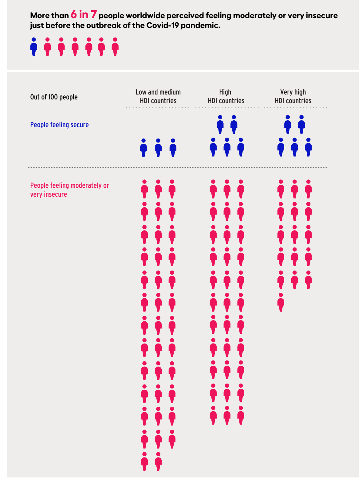
Figure 1 Perceptions of human insecurity are widespread worldwide